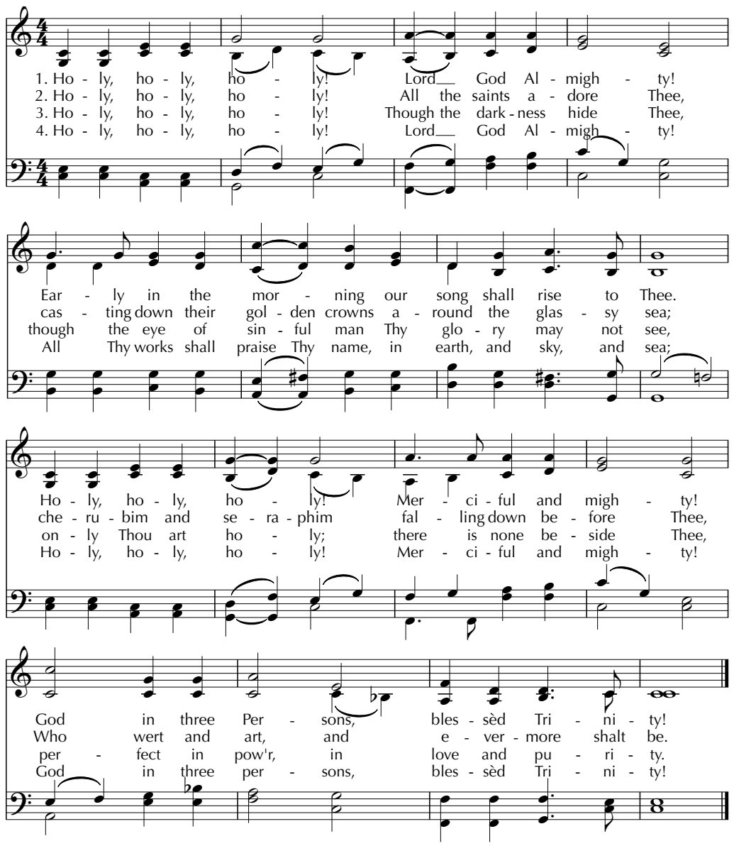
"Holy, holy, holy, is the Lord God Almighty, who was and is to come!" – Revelation 4:8 Text: Reginald Heber (1826) Tune: NICAEA (Dykes)